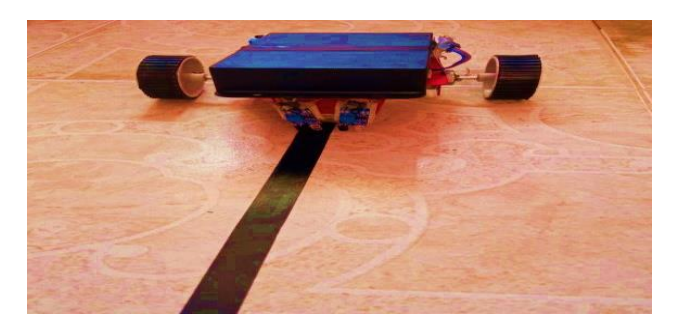
Figure 5: Robo Architecture.