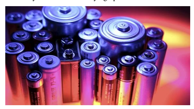
Figure 2: Batteries

which are fabricated to be applied just a unmarried time until all its strength is launched. (2) Secondary cells or battery-powered batteries that can be applied on numerous events [11] seen in figure 2. These kinds are available diverse structures, shapes, sizes, masses, and voltages, which buyers take in idea relying upon their necessities.