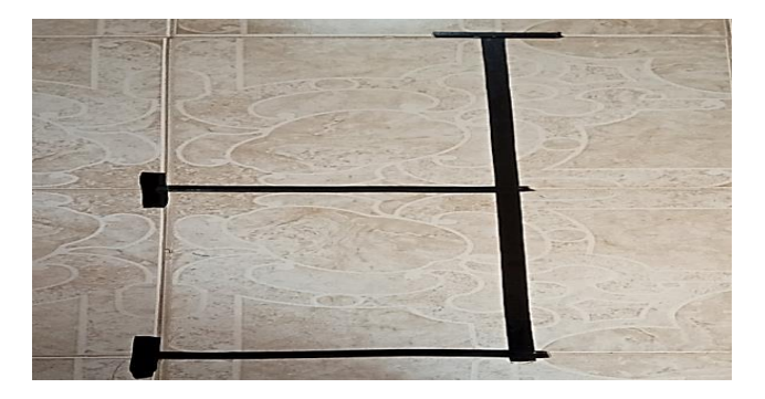
Figure 4: Directions