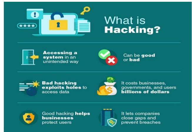
Fig 2: Concept of Hacking

During 1971, John Draper (also known as Captain Crunch) one of the best known early phone hackers and one of the few personalities who is known as the father of hacking.” Hacking is a malicious activity in which a person (known as Hacker) exploits the weaknesses and vulnerabilities in a system for self profit or gratification. It is basically referred to gaining unwanted access to a computer to obtain sensitive information stored in it by means of password cracker software or any other techniques to get the confidential data. This is done to either point out the loopholes in the security or to intentionally sabotage the computer. This is generally considered as a kind of malicious activity. Malicious hacking is basically the unauthorized access and use of computers and associated network resources. Malicious software programs such as Trojans, malware and spyware are utilized to gain entry into an organization’s network for stealing vital information. It may result in identifying theft, loss of confidential data, loss of productivity, use of network resources such as bandwidth abuser and mail flooding, unauthorized transactions using credit or debit card numbers, selling of user’s personal details such as phone numbers, addresses, account numbers etc. However, when the hacker has clear intentions to break into a computer system to save the organization from intrusion attacks, the process is termed as Ethical Hacking.[3][8][11][12]