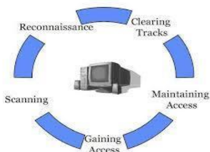
Fig. 3: Methodology of Ethical Hacking