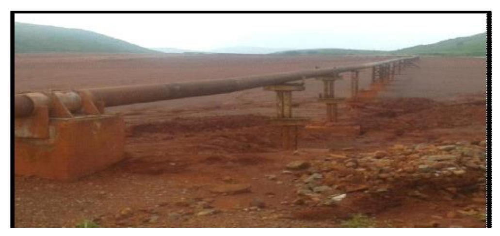
Figure 1: Red mud pond of NALCO at Damanjodi

The RM used in the exploratory investigation was obtained from NALCO in Damanjodi, Koraput, Odisha, India (figure-1). Per tonne of alumina delivered, around 0.8 to 1.5 enormous loads of RM are produced. The RM is slurry-released into the RM lake . The size of the RM lake is around 212 hectares. It depicts an ecologically tainted water sprinkling structure for dust collecting.