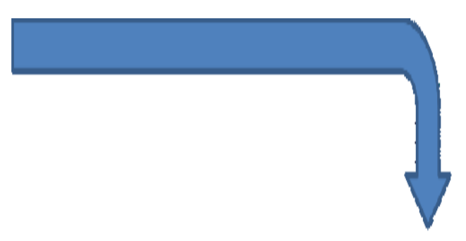
Figure 3: L-Shaped bent loop