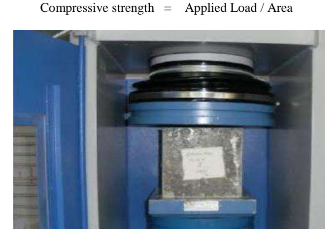
Figure 1: Compressive Strength Test on Cubes

The compressive strength of the blocks was tried following 7 days and 28 days.