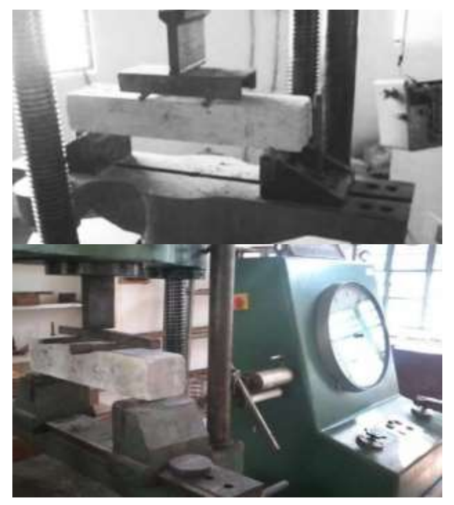
Figure 2: Flexural Strength Test on Beams

P is the maximum load that the test machine has applied. The example's width is given by b. The level of the example is d.