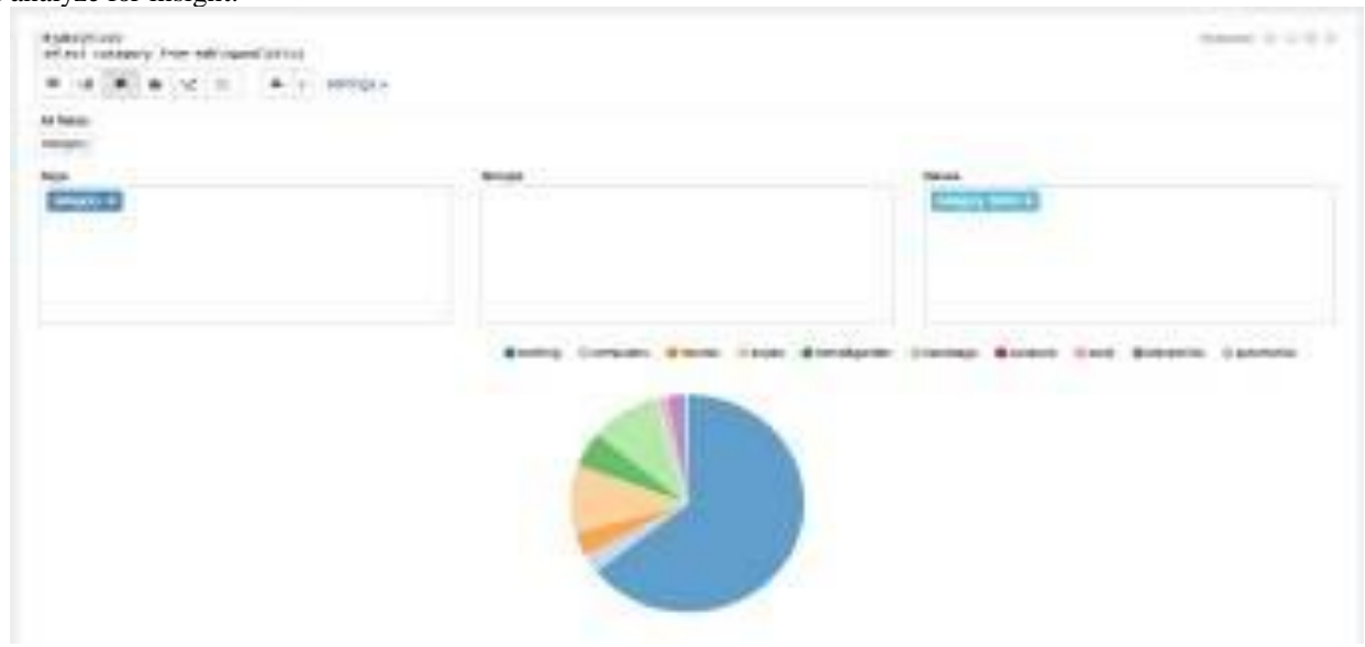
Fig. 4: Interest category distribution

The Use of big data is to optimize the company inventory based on regional and seasonal preferences of customers in each geographic area they serve. Furthermore, the use of big data is to implement an in-store, mobile navigation system that signals customers to sales based on their preferences and location in store.