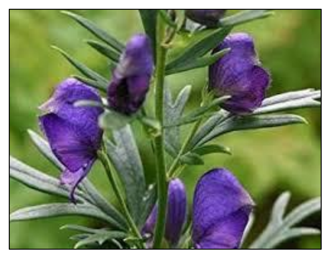
Figure 1: Image of the plant Aconitum heterophyllum. It is used in many Asian traditional medicine preparation. It belongs to the family Ranunculaceae Figure courtesy [3]

Ayurveda is one of the ancient traditional medical systems of India & Aconitum heterophyllum is being used in many ayurvedic formulations till date. Moreover, many species of Aconitum are being used in various traditional medicines of the nations of East Asia and the Himalayan nations. This plant is known as aruna in Sanskrit, atees in Urdu, and atis in Hindi. Aconitum heterophyllum is from the kingdom plantae, division 'Magnoliophyta', family Ranunculaceae, genus Aconitum & species is Heterophyllum (Table 1). The tuberous roots of this plant are used for its various roles such as antidiarrheal, hepatoprotective etc. In figure 1, an image of this plant has been illustrated. This plant is found in the high Himalayas. As many species of the plant has poisonous characteristics therefore one needs to be cautious while utilizing this plant. The primary aim of this review is to expand upon the therapeutic function of this plant [1,2].